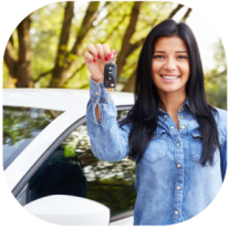
7 residents able to purchase vehicles during their stay