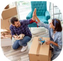
44 residents moved to independent living