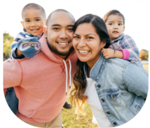
16 families with children provided residency